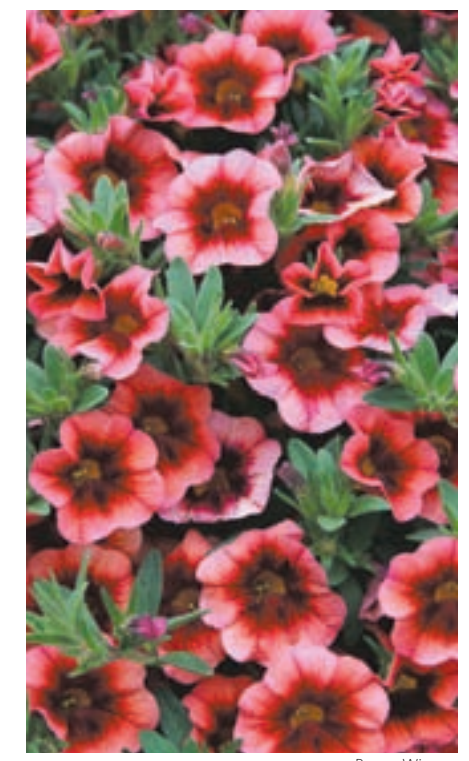
'Superbells Coralberry Punch'

'Superbells Blackberry Punch' is so unusual, with a dark pink edge and contrasting eye that is intensely deep purple. Prepare yourself for a drama queen on your patio or at your entrance. This plant simply stopped me in my tracks when I first saw it. You will find the inner artiste in yourself when you arrange a container with it-have fun with this one!