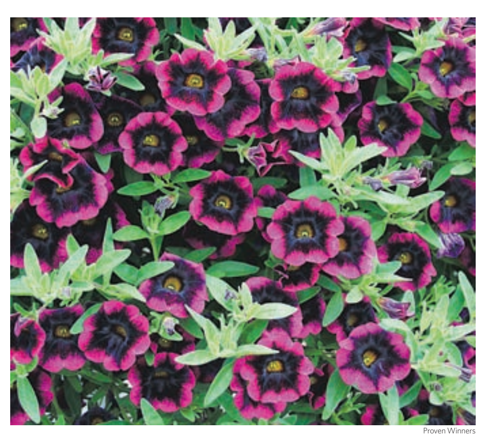
'Superbells Blackberry Punch'

From seed collected in Thailand comes this larger-than-life exotic for the not-so-timid gardener. This huge strain of the giant elephant ear will surpass all expectations a gardener could have of creating their own little oasis in paradise. Although each seedling will differ slightly, each leaf grows approximately 5 feet long by 4 feet wide, creating a massive plant with attractive glaucous green foliage. Although grown mostly for the foliage, 'Thailand Giant' may also be adorned with clusters of large, scented lily-like flowers. Part shade to part sun. Up to 9 feet tall and wide.